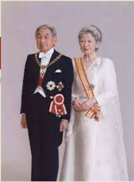
Emperor Emeritus Akihito Abdicated in October 2019