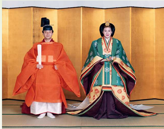
Emperor Naruhito: 126 th Emperor