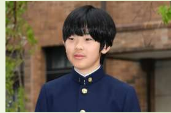
Prince Hisahito: Son of the Crown Prince Fumihito

According to Imperial House Law, only male-line male prince in Imperial family can succeed the Imperial Throne. Crown Prince Fumihito, Second Son of the Emperor Emeritus and younger brother of The Emperor Naruhito will succeed the next Imperial Throne and son of the Crown Prince, Prince Hisahito will be next.