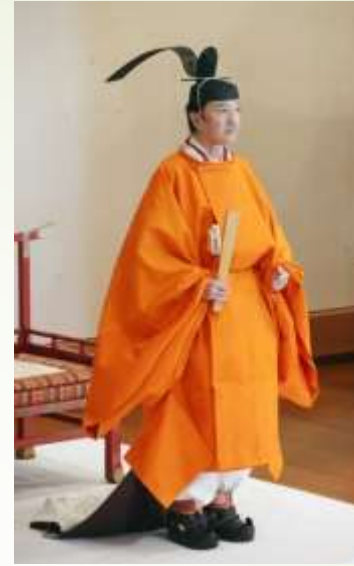
Crown Prince Fumihito: Second Son of the Emperor Emeritus